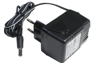
R-6, 230 V ac Recharger PN: 6180-062