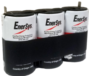
Lead-Acid Battery Pack PN: 6280-035