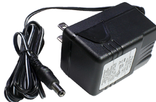
Power Adapter R-5, 115 V ac PN: 6180-060