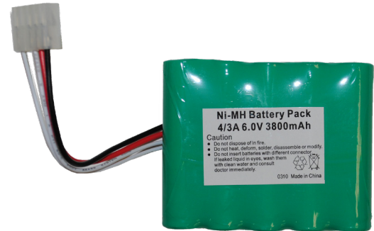
Internal NiMH Battery Pack PN: 6280-046

Like NiCds, NiMH (nickel metal hydride) batteries are prone to self-discharge – 10% to 15% of charge is lost in the first 24 hours, then continues at a rate of 0.5% to 1% per day. For maximum performance, charge the batteries just prior to use. These batteries contain fewer toxic metals than NiCds (nickel-cadmium) and are currently classified environmentally friendly.