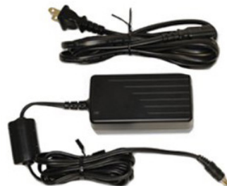
PSC-pbxU Supply/Recharger PN: 6280-024