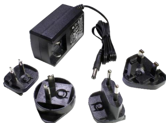
PSC-2U Universal Recharger PN: 6280-022