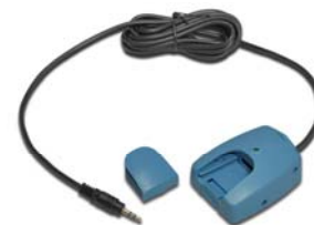
Remote Laser Dock