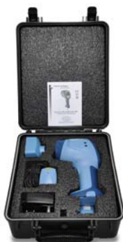
Deluxe Kit Case