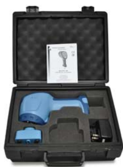
Standard Kit Case